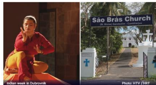
Indian week in Dubrovnik